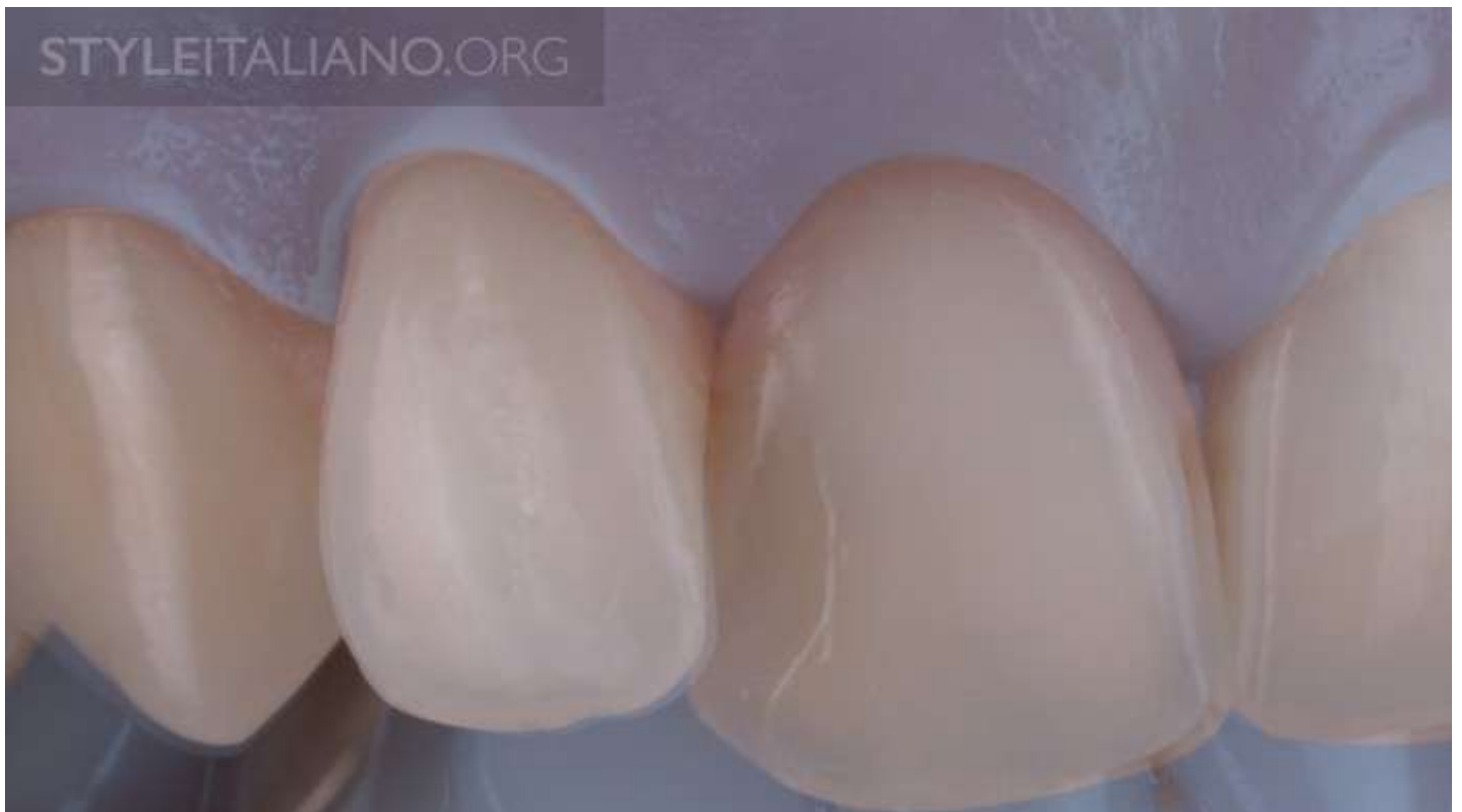
Img. 6 - With this technique, the rubber pushes the gingival tissue interproximally, up to some millimeters in some cases, which helps the dentist to have a better view.