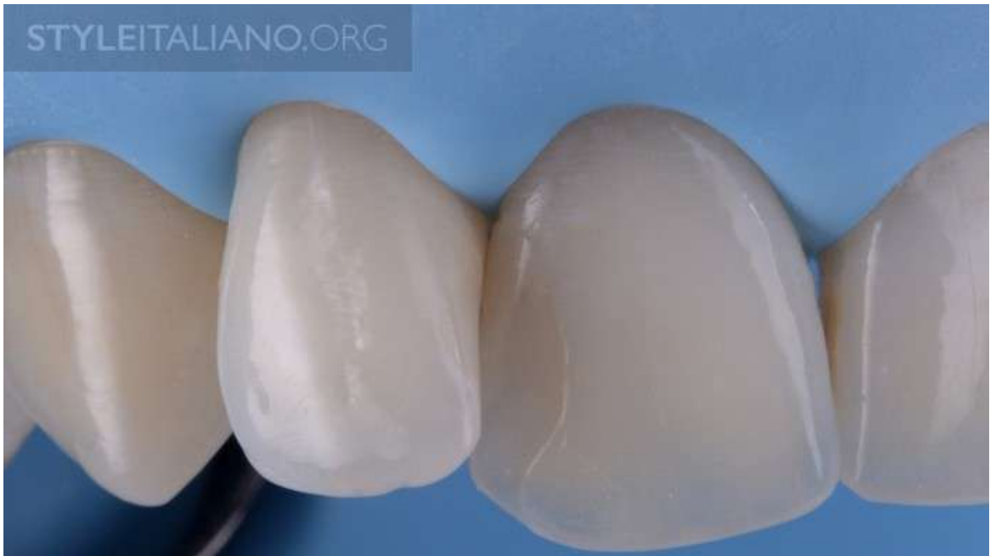
Img. 5 - This picture shows inversion with knot ligatures.