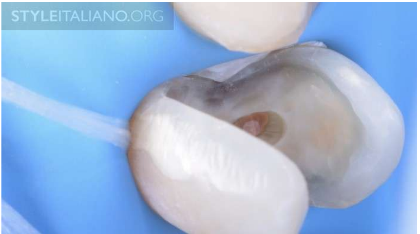
Img. 10 - A teflon tape was used to isolate the proximal area.