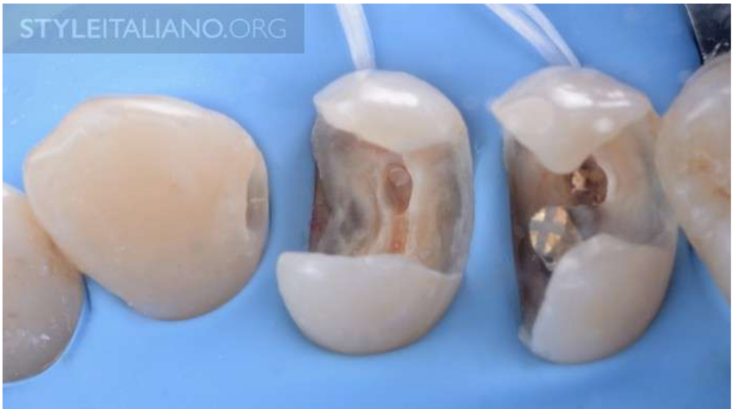
Img. 9 - After removal of the old composite the proximal areas were not isolated.