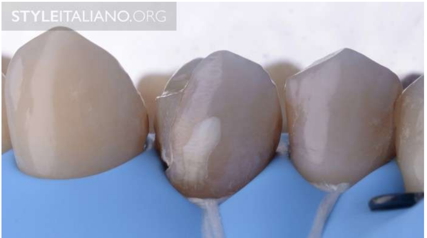
Img. 8 - Clinical case with inversion with knot ligatures