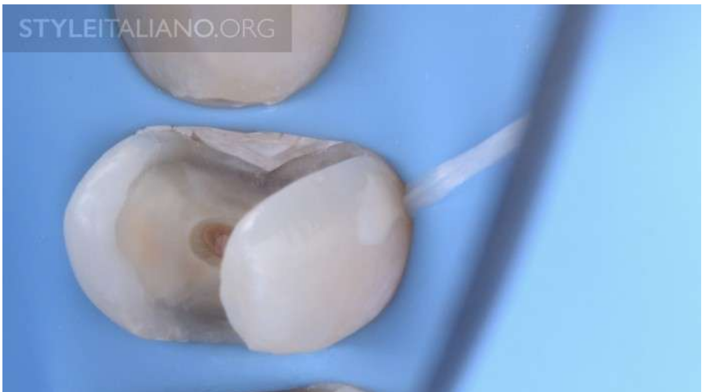
Img. 11 - At this time we are ready to do the restoration.

Now we have all the tools and solutions to isolate in almost all the most challenging situations. If, still, we can't isolate, we could then ask ourselves if that tooth has a good prognosis over time. I use the following rule a lot - "If I can't isolate, that tooth is not restorable in that condition", that leads me to clinical choices as a crown lengthening or doubts about the prognosis of that tooth.